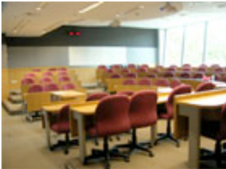
Seating style shown above. Screens are out of picture to the left.

Seating in the seminar room is in a semi-circle around a small podium where the cables are and for you to leave your laptop.